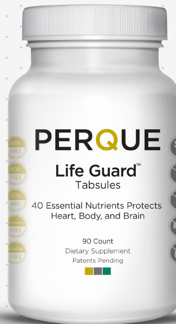
PERQUE Life Guard's Relative Formula Potency Compared to Four "Best of the Best" Brands**

Due to its unique formulation and using only fully active components, PERQUE Life Guard tabsules provide the advantages of capsules and the convenience and enhanced shelf stability of tablets.